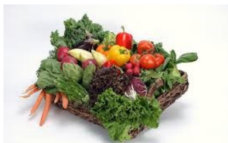
Mixed Garden Flats